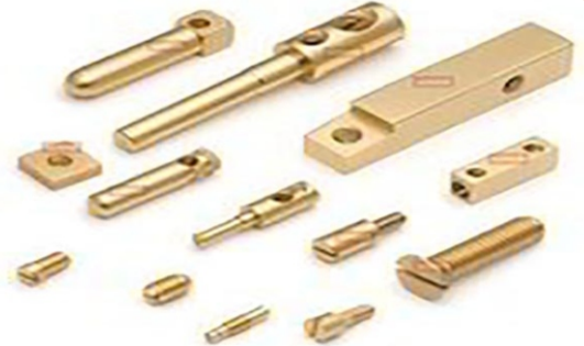
BRASS ELECTRICAL PARTS