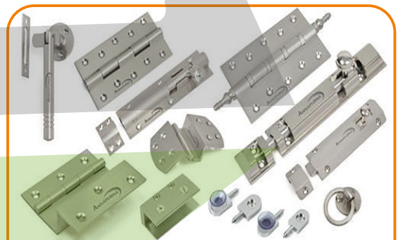
BRASS BUILDER HARDWARE