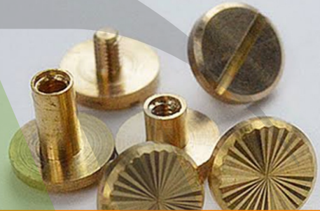
MACHINE CUT CHICAGO SCREW