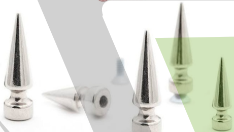
25 MM Spike