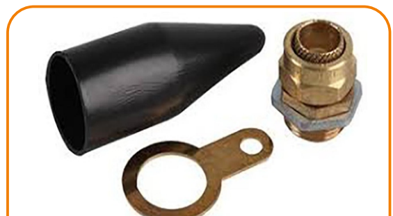
BRASS Cable Gland