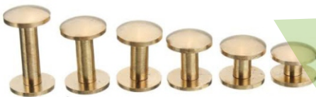
4 MM/16 MM CHICAGO SCREW PLANE