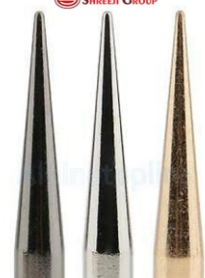
LONG 2 INCH SPIKE SCREW