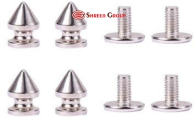
8 MM Spike