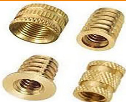
BRASS MOLDING INSERTS