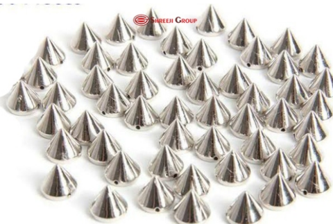
UMBRELLA STUD SCREWS