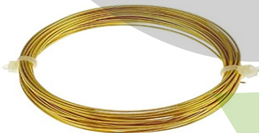
BRASS IMITATION JEWELLERY