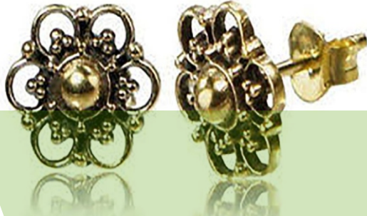
BRASS EAR STUDS