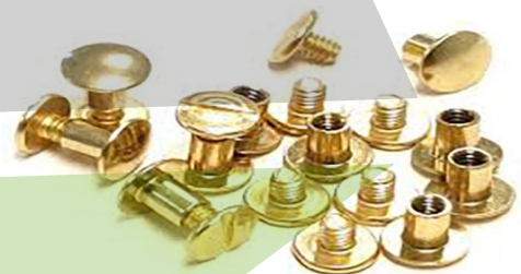
BRASS LEATHER SCREWS