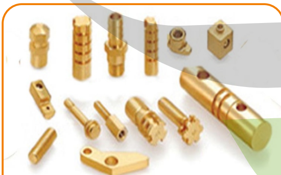
BRASS AUTO PART

We are among the reputed organizations, highly engaged in offering an optimum quality range of products. The offered parts are widely acknowledged by our valuable clients for its high strength and seamless finish. These parts are available in various specifications as per the demands of our precious clients. The provided parts are precisely manufactured by our experienced professionals using the premium grade basic material and modern techniques. Offered parts are used in the assembling of machine and its parts. Furthermore, these parts are available in the market at competitive price.