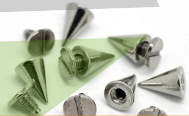
CONICAL SPIKE SCREW