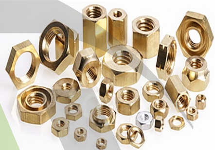
BRASS HEX NUTS